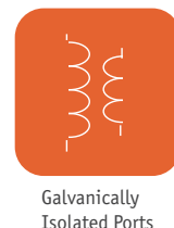
Galvanically Isolated Ports