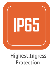
Highest Ingress Protection