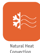
Natural Heat Convection