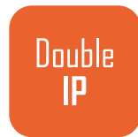
2 IP addresses per Device