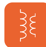
Galvanic Isolated Ports