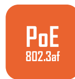
Power over Ethernet