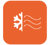
Natural Heat Convection