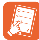
User-Friendly Web Interface