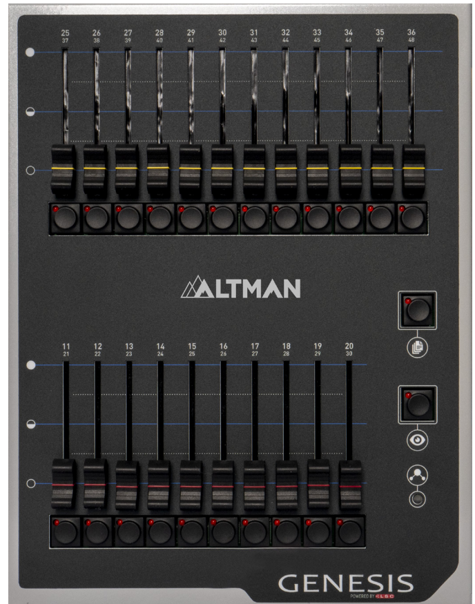
Genesis Control Wing