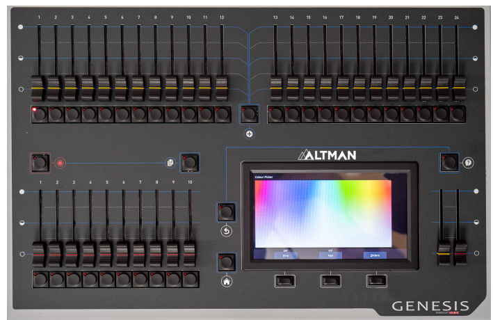
Genesis Control Console