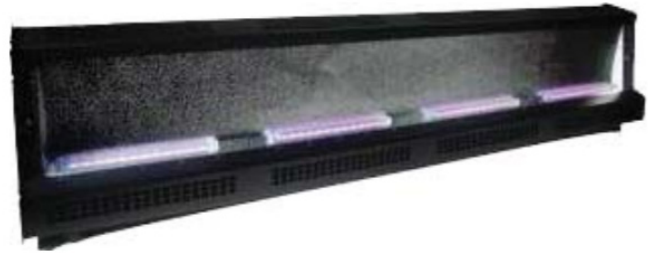
Spectra Cyc 400 RGBW

Designed for use on 10 to 16-foot centers, individual units can be linked side by side for greater saturation of light. The Spectra Cyc 400 is compatible with DMX / RDM protocols, and comes with a library of preprogrammed single colors and various color mixes. Units can be utilized for both floor and sky-cyc applications.