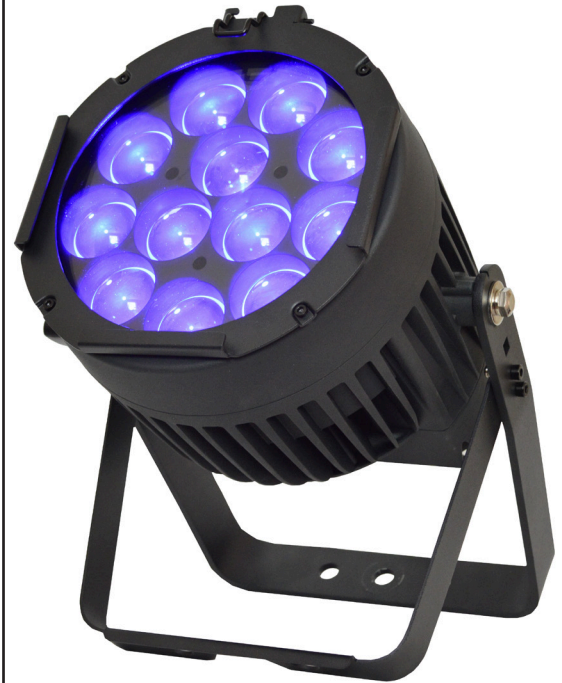
AIP200 RGBL Zoom Par

The motorized zoom produces a beam spread between 6.5° and 50° with built-in stops at five different set points ensuring precise beam spread repeatability. This zoom can be set from either the back panel and locked out, or directly from the console.